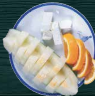
Turkish Fruit platter (1-2)