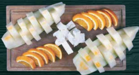
Turkish Fruit platter to share (3-4)